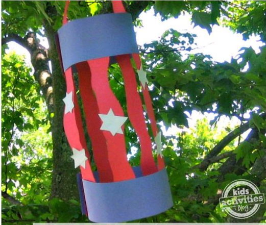
MAKE A PATRIOTIC LANTERN